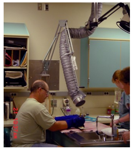
Figure 1: A worker using local ventilation while working with anesthetic gas

Decreasing oxygen flow rates during anesthetic gas administration can also reduce the concentration of waste gases in the work environment. For example, reducing the oxygen flow rate from 2 to 0.4 for a single mouse on a nose cone will still anesthetize the mouse while reducing the concentration of waste gases in the work environment to more acceptable levels.