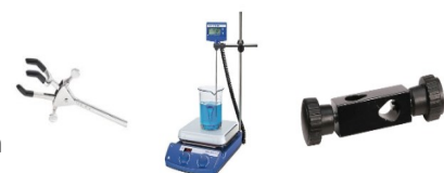
Figure 3 Boss head clamp on