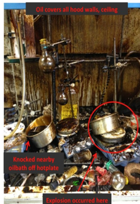
Figure 3 UMN hot plate incident hot oil sprayed all over fume hood.

Fires caused by incorrect temperatures on hot plates are reported by Universities several times a year. Lawrence Berkeley National Labs, Oak Ridge National Labs and others have issued safety alerts. Photo at right is from one of the UMN incidents.