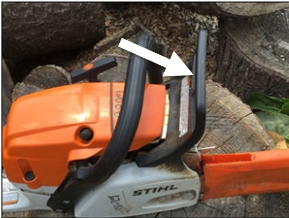
Figure 4. A chain brake/kickback protection device.

2.3 Minimum safety requirements for chippers. At a minimum, chippers shall be equipped with the following safety features: