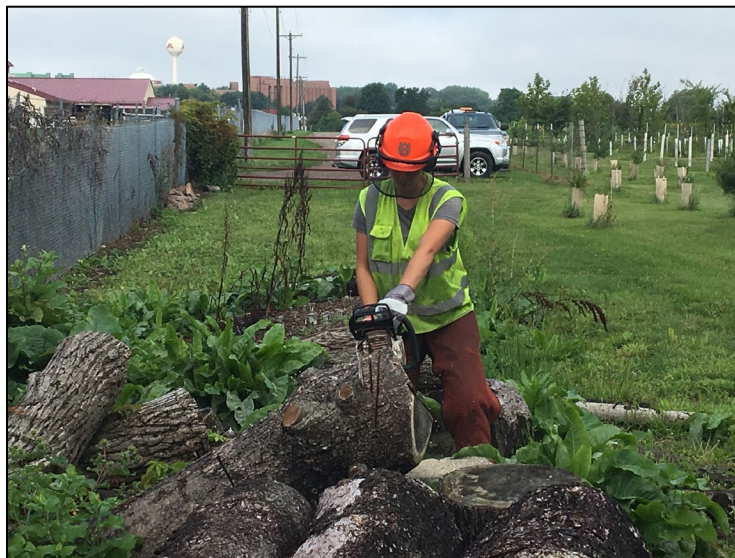
Figure 9. Proper body positioning.