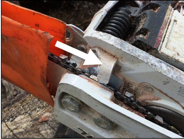
Figure 3. A chain catcher.