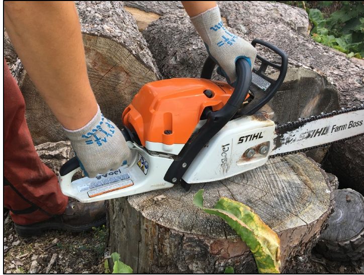
Figure 7. Proper hand grip for top-handled chain saw.