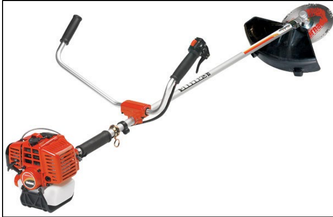
Figure 1. An example of a brush cutter.