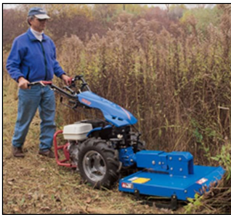
Figure 2. An example of a walk-behind brush cutter.