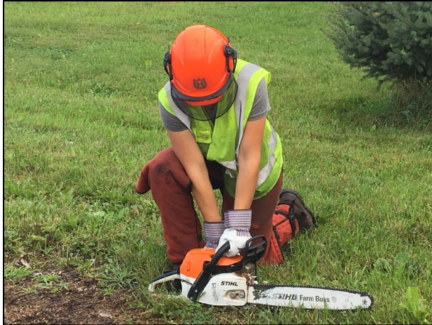
Figure 5. Acceptable starting method.