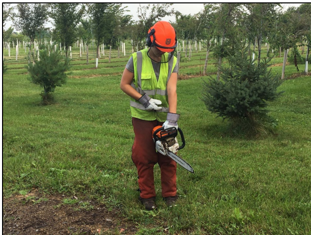
Figure 6. Acceptable starting method.

5.3 Proper hand grip on top-handled chain saws. While cutting or carrying short distances (see section 5.8), chain saws shall be held with two hands. During cutting, operators shall grasp the forward/top handle, with the left thumb wrapped entirely around the handle, and the right hand firmly gripping the rear handle in the same manner.