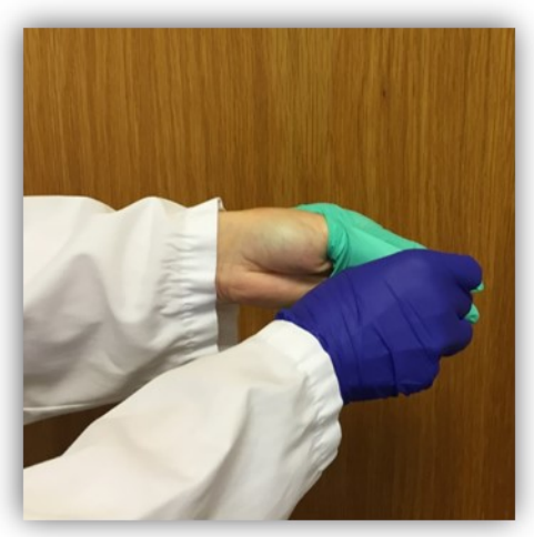
Figure 2: As you pull the glove over your fingers, the glove will be pulled inside-out.