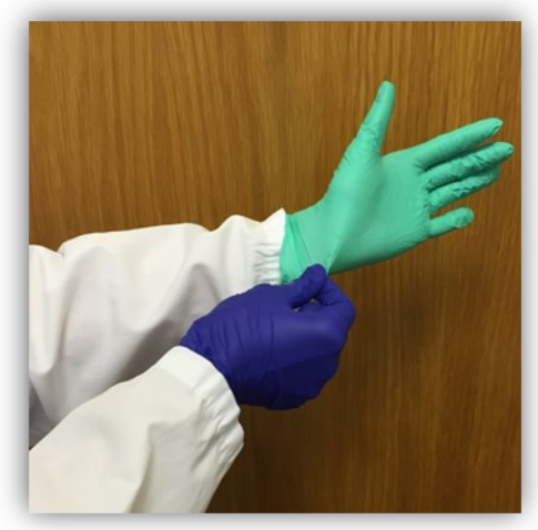
Figure 1: Grip one glove near your wrist.