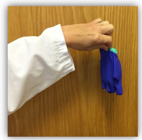
Figure 6: The 1st glove will be contained within the 2nd glove. Dispose appropriately.