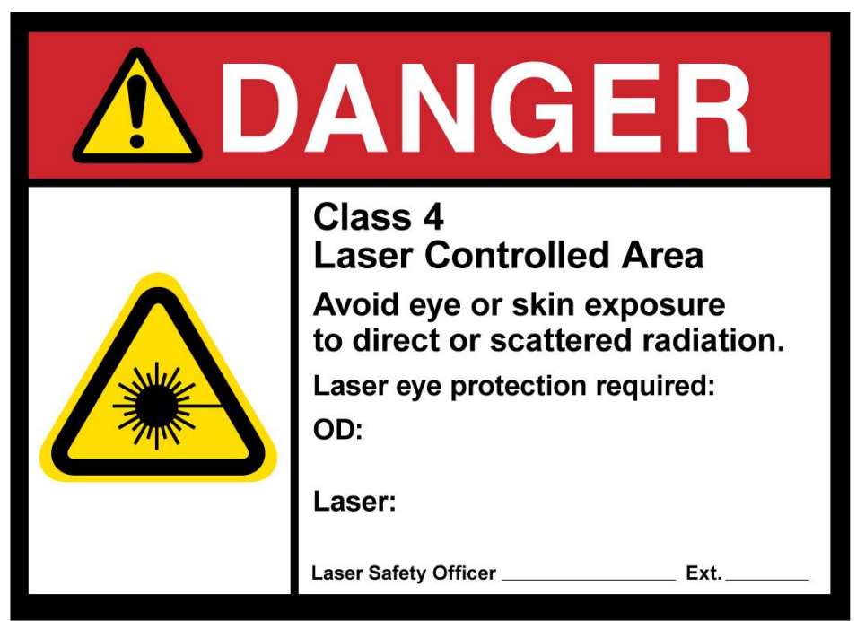
Fig. 1. Laser sign for Class 4 lasers (multi-kilowatt). Reserved for lasers that may inflict severe or fatal injuries if bodily exposure occurs.

Areas in which Class 3B or Class 4 lasers or laser systems are used must post signage warning people of the potential hazards. It is the responsibility of the laboratory to acquire and maintain proper signage. At a minimum, the sign layout and wording must detail the highest-class laser contained within the area. Additional signs for lower-class lasers may also be displayed. These signs must comply with ANSI Z535 series (e.g., ANSI Z535.2: Environmental and Facility Safety Signs) and ANSI Z136.1, Safe Use of Lasers . Examples of laser warning signs are shown below.