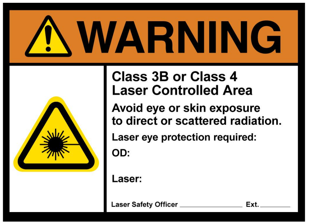
Fig. 2. Laser sign for Class 3B and Class 4 (below 1 kW) lasers.