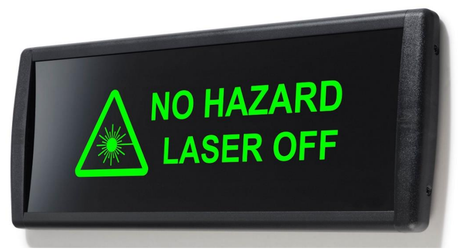
Fig 5. Example of a lighted sign operated either manually or automatically when laser system is activated.