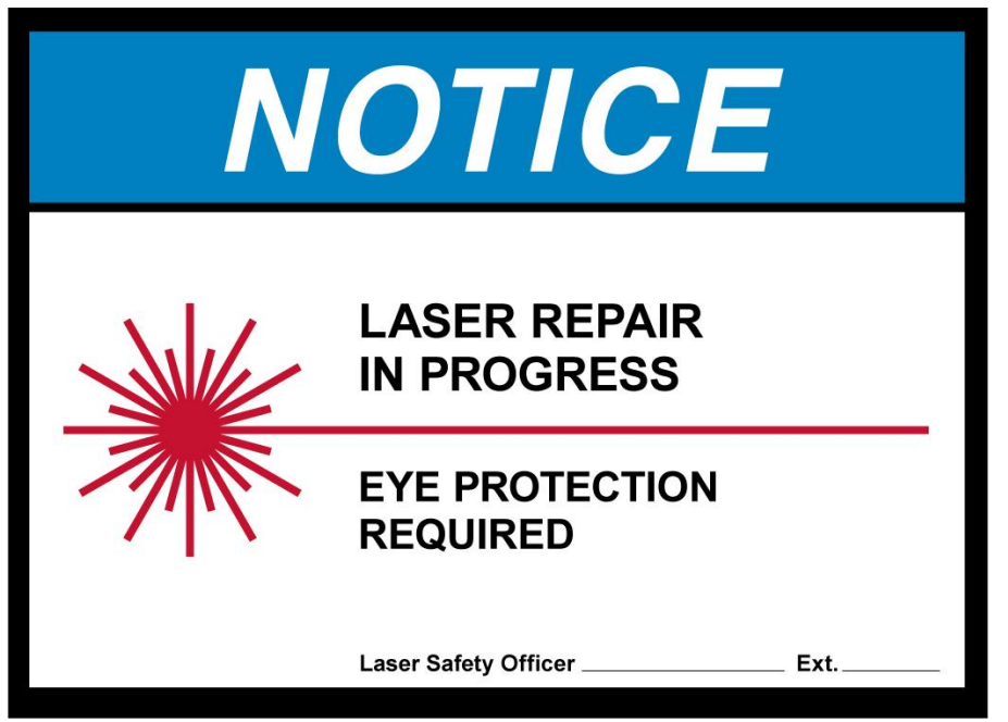
Fig. 4. Signage used when a laser or laser system is undergoing maintenance. Often displayed when a normally enclosed laser system is undergoing repair or maintenance and safety interlocks, protective panels, etc. are removed allowing for the possibility of laser radiation exposure.