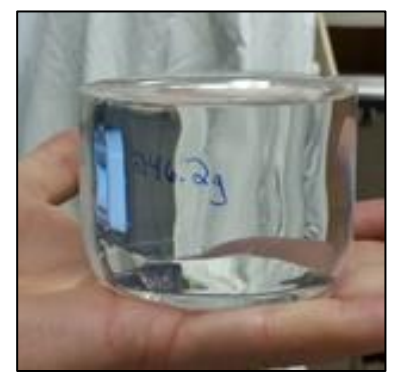
Figure 5: Polymer Puck left over from the exploded bottle